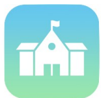
Apple School Manager

Trainings are facilitated using Skype Meeting / Skype Web App, Q & A will be available. For the latest schedule of dates, times and meeting details, visit: http://sprint.com/c3ignite > Instructor Led Webinars.